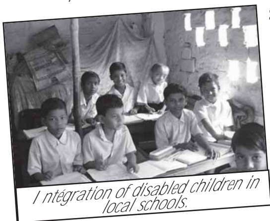
Integration of disabled children in local schools.

The majority of the parents have spent years taking their children, from one hospital to another, to dispensaries, and even to healers to find a solution. They have spent their small savings without ever obtaining any answers to their questions, nor a diagnosis of the «disease» of their child. The time spent in one day of consultation made them lose a part of their small daily income. So in the end they stopped