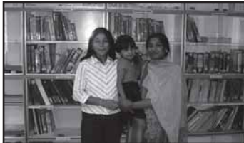
The happy librarians.

Also necessary, was the construction of closed shelving, in order to protect the books from the ever-present Indian dust. All these improvements were carried out with MIBLOU's financial support.