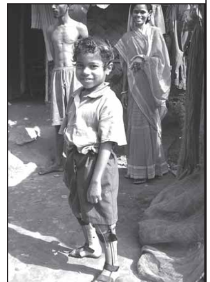
On the new road of life!