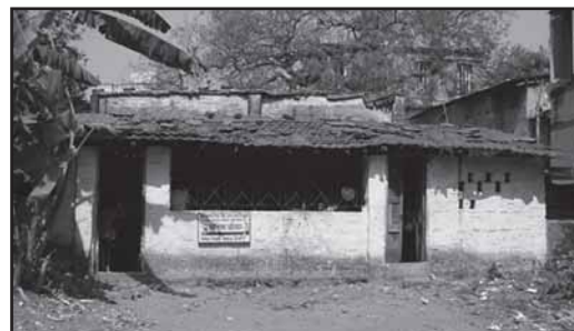
Small local school.

giving the necessary care. Today a few hundreds families are followed and benefit from various types of support. With its 30 years of experience, the Spastic Society is there to teach other NGO's, what daily care and education can be given to cerebral palsy children (CP). More than 300 teachers and social workers participate in training courses that enables them to approach, with confidence, these «different» children. They learn how to facilitate the integration of these children in the small schools of the district. The parents are also shown how to obtain official documents, as «disability card» and get a small governmental pension.